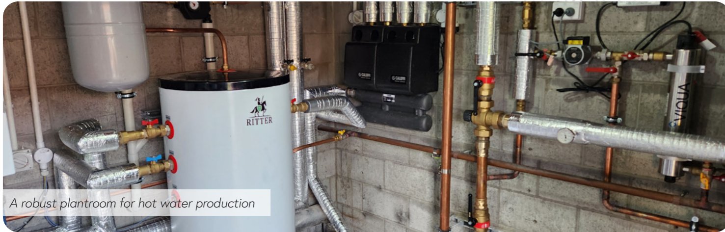
A robust plantroom for hot water production