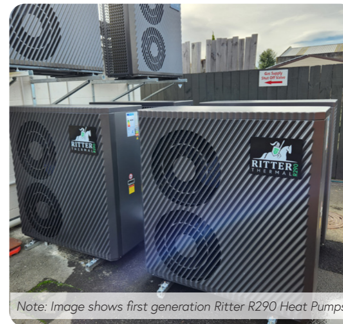
Note: Image shows first generation Ritter R290 Heat Pumps

The client had an ageing gas fired plant of 300kW powering a combination of underfloor heating and hot water production which was due for replacement. As an organization they had a strong drive for decarbonization and environmental responsibility. Replacing the existing plant with a hybrid gas and heat pump solution allowed them to guarantee performance while at the same time drastically reduce their carbon footprint.